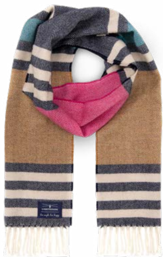
Pink/Sunrise/Deep Teal Stripe

Made in Ireland from only the finest quality merino wool, our collection of Lambswool scarves are wonderfully soft and luxuriously warm.