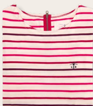
Red & Pink Stripe

Causeway is the Lighthouse take on a classic Breton top. Now available in a new range of colours, this easy worn style is the perfect go-to top for the season.