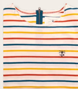
Teal & Burnt Orange Stripe