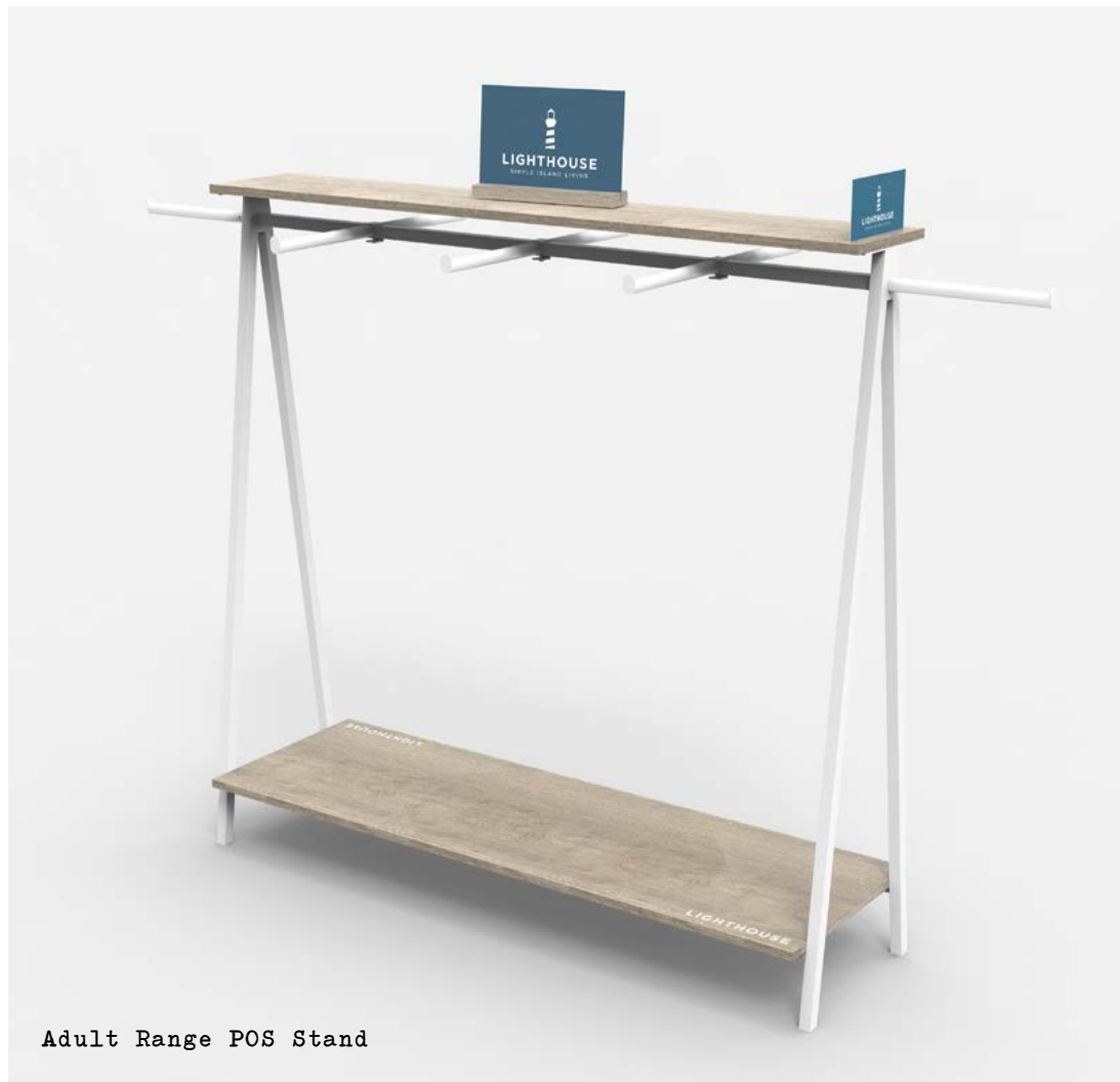
Adult Range POS Stand